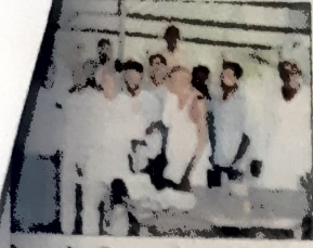
शहर में रविवार को आयोजित फॉगिंग